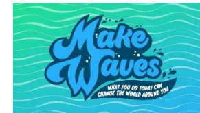
Make Waves: What You Do Today Can Change The World Around You