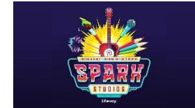
Spark Studios: Created In Christ, Designed For God's Purpose