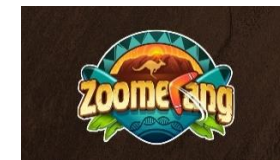
Zoomerang: Returning To The Value Of Life