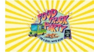
Food Truck Party: On A Roll With God